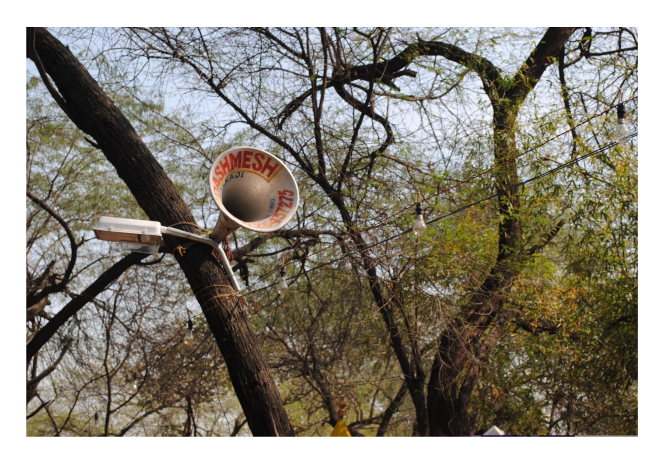
Light and Throat Together