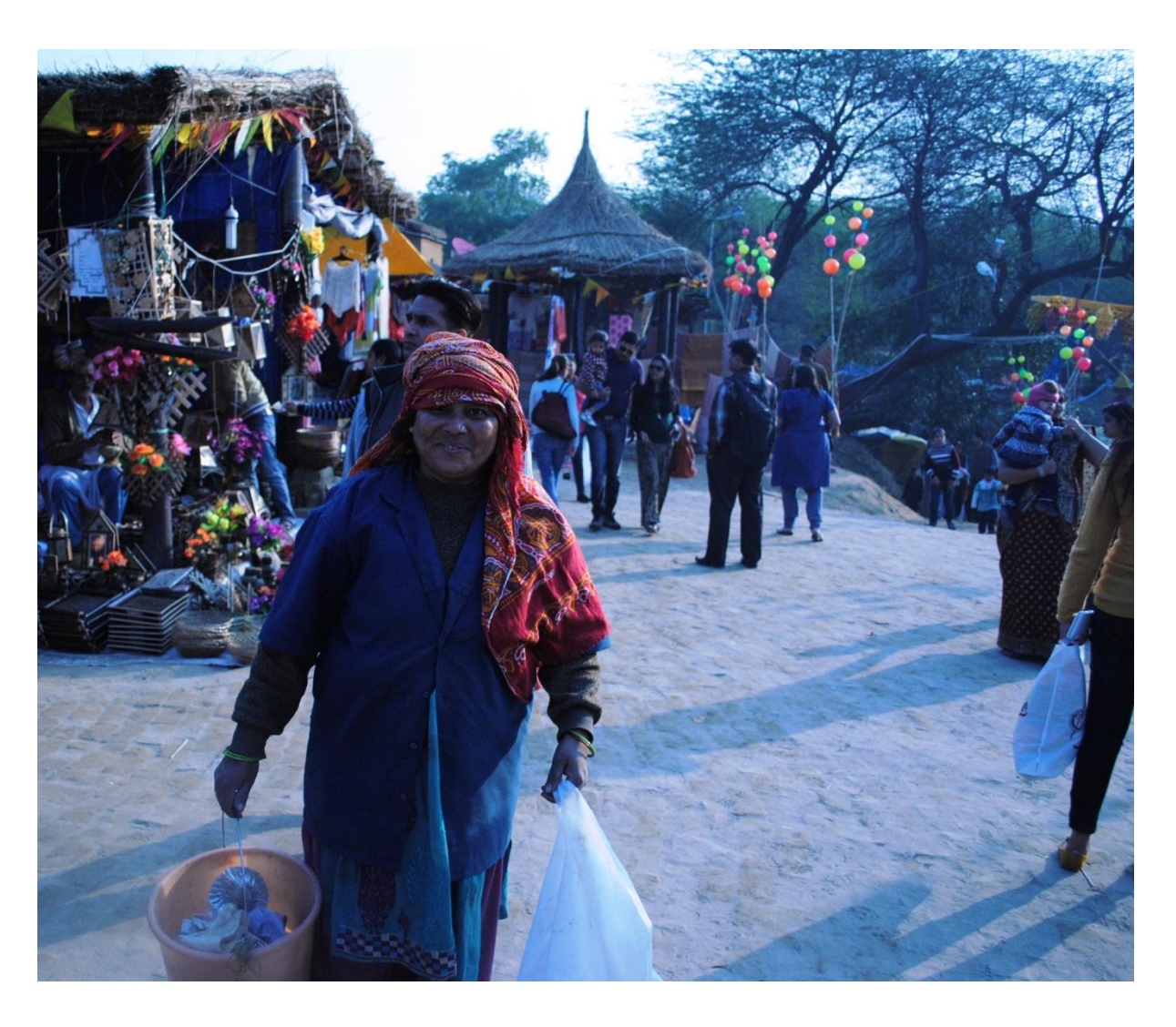
The 'Karma' Yogi