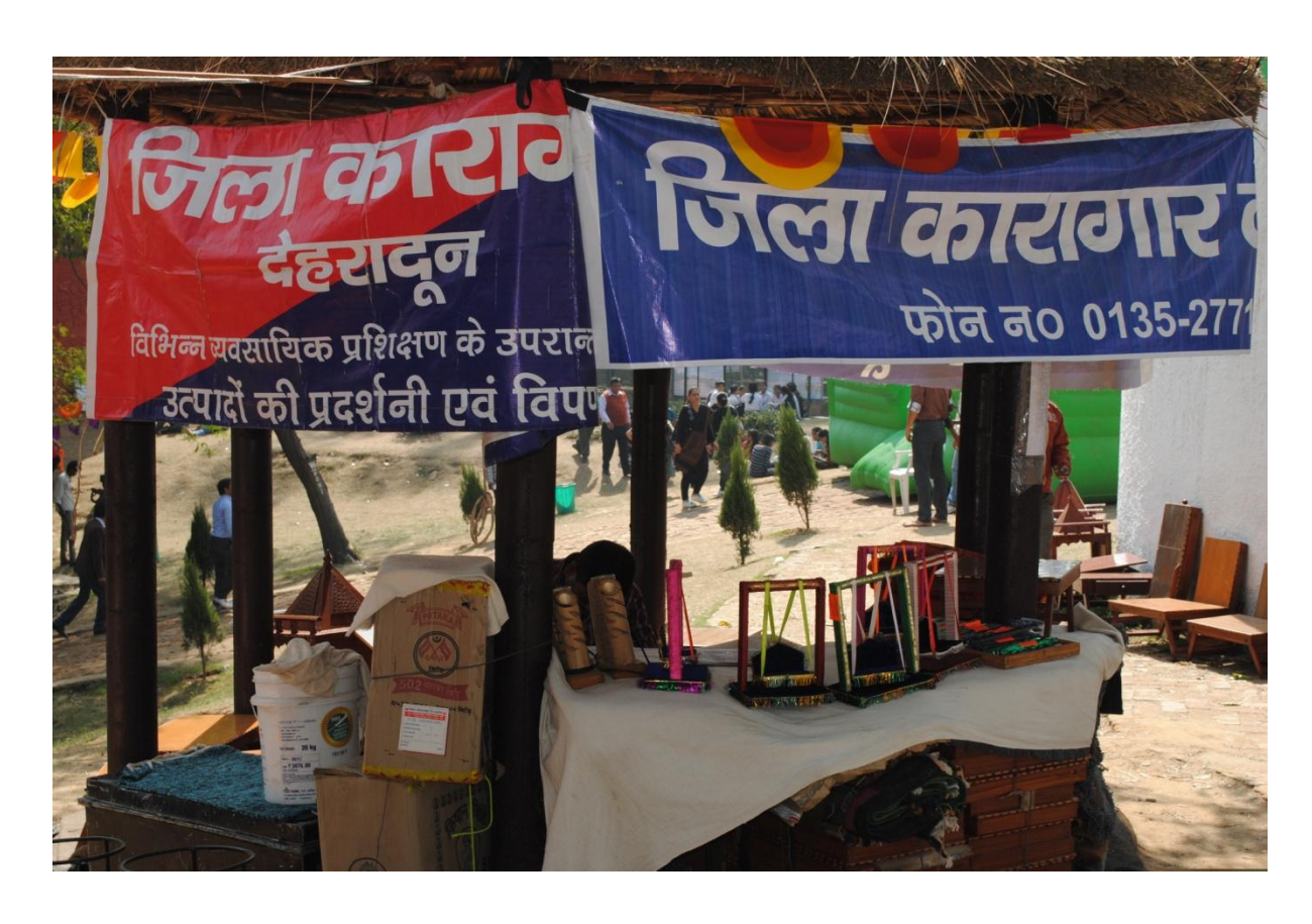
The Reformed Prison