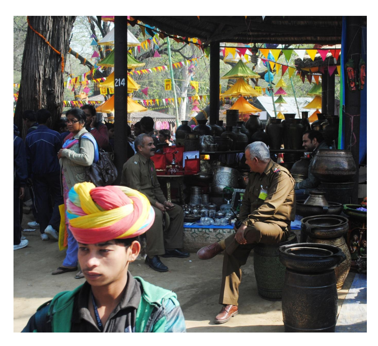
Charcha in Chairs