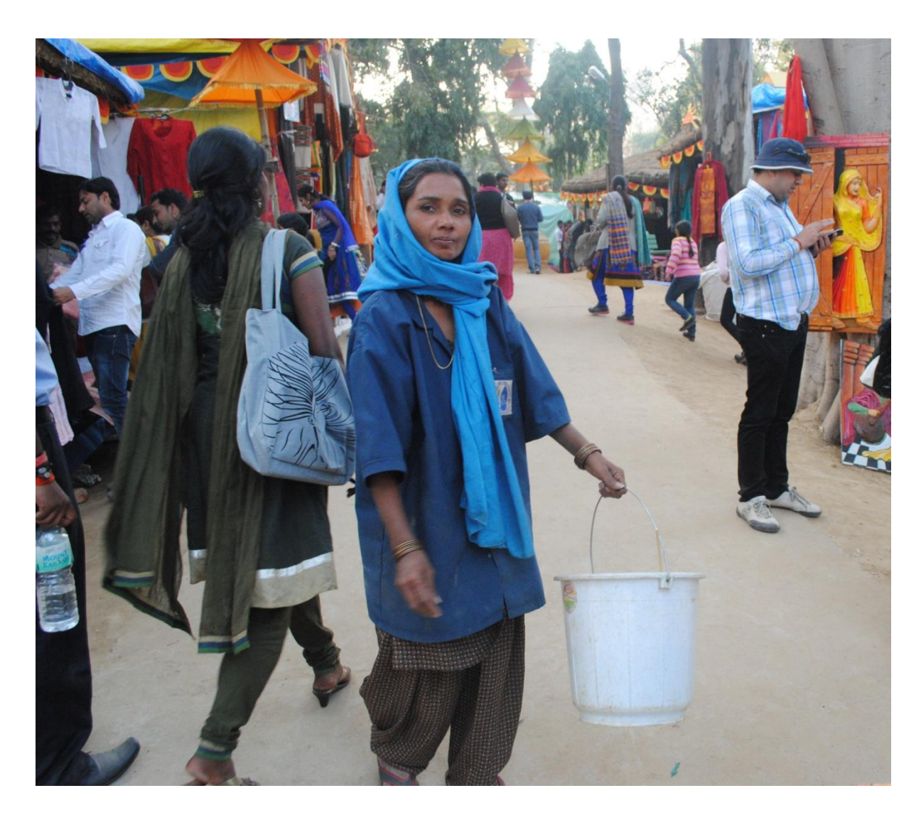
Work is dignity