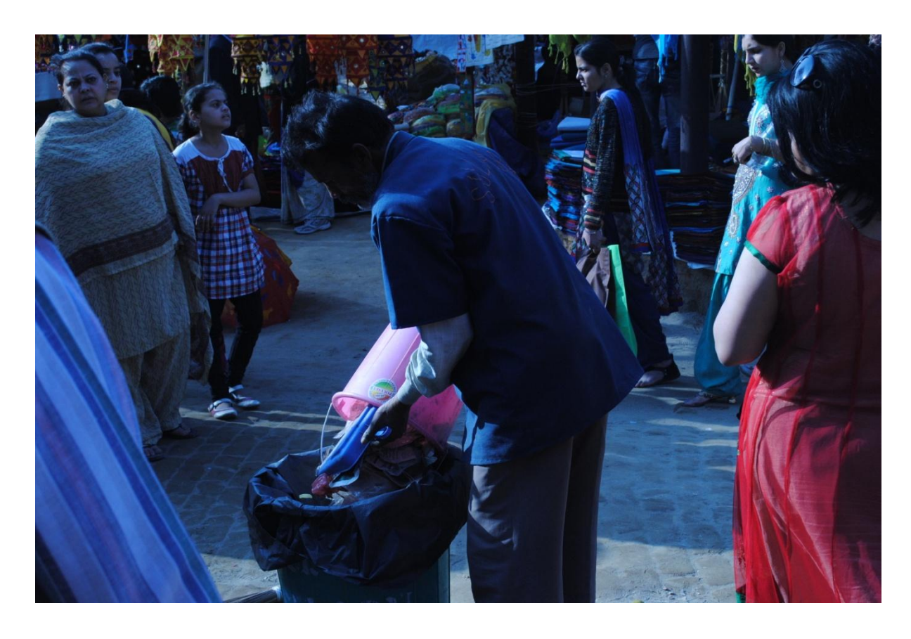
Cleanliness is my only Job