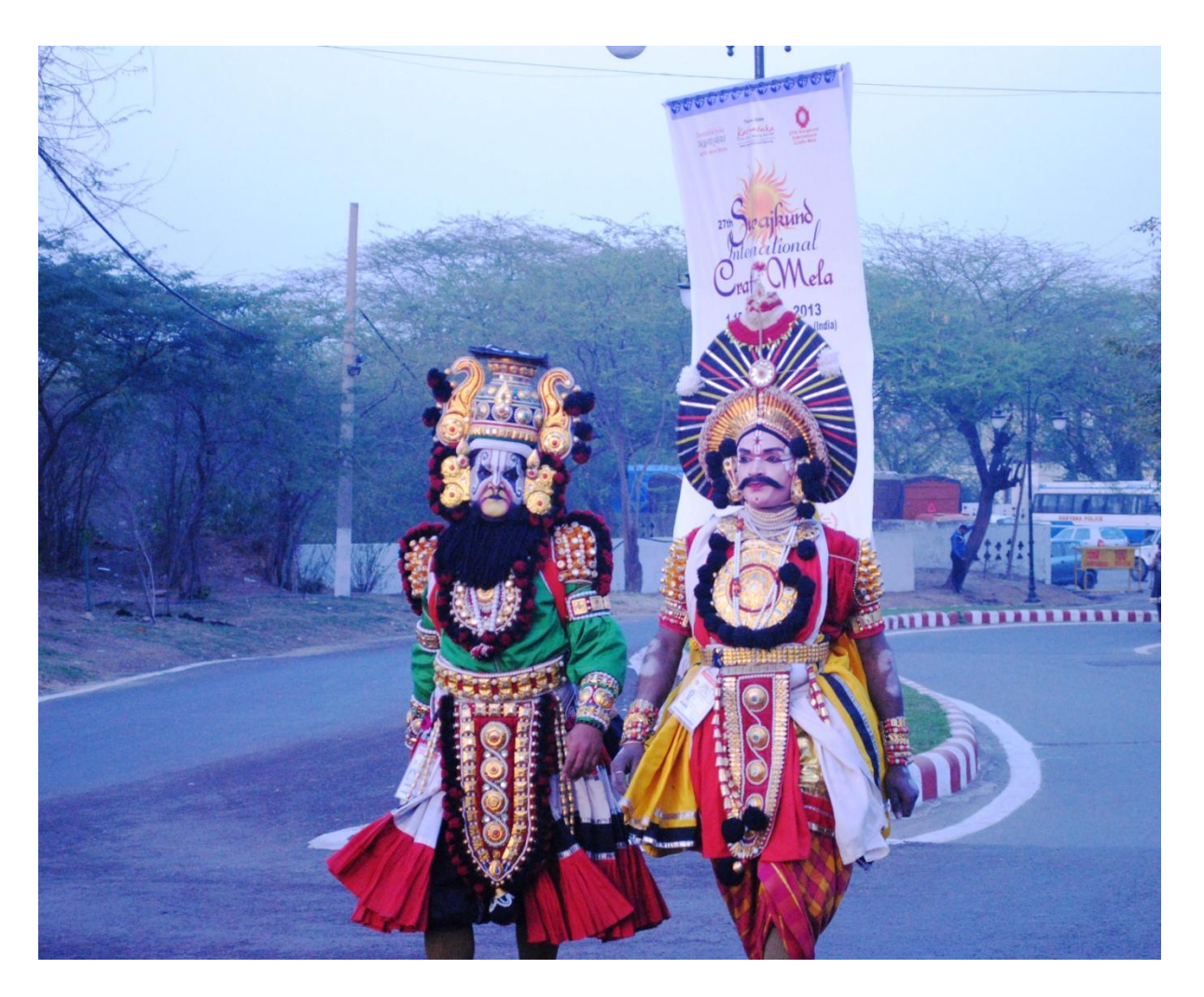
DakshaYagnam Artists::Sent by Lord Shiva to check the security?