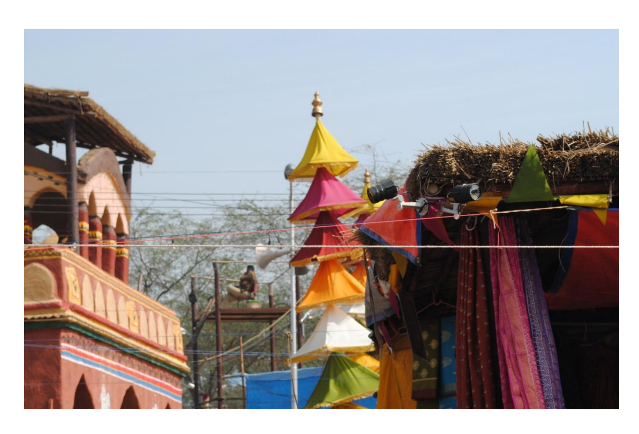
Cop,Call and the Camera