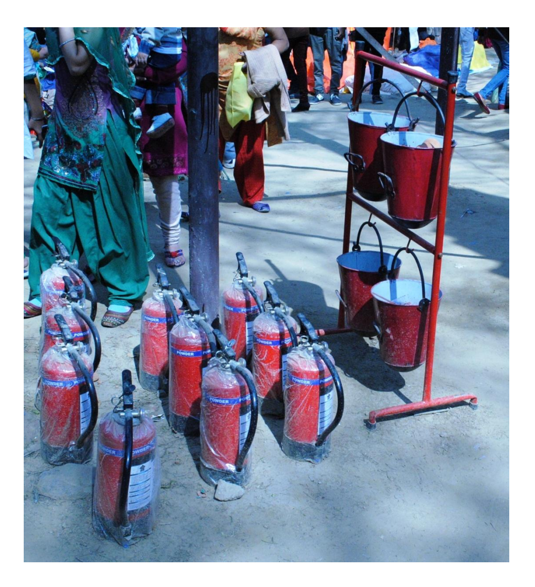
Too new to be used