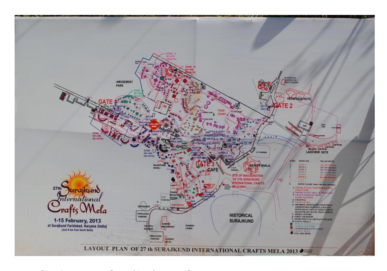
Not the Art, it is the c'Art'ography.