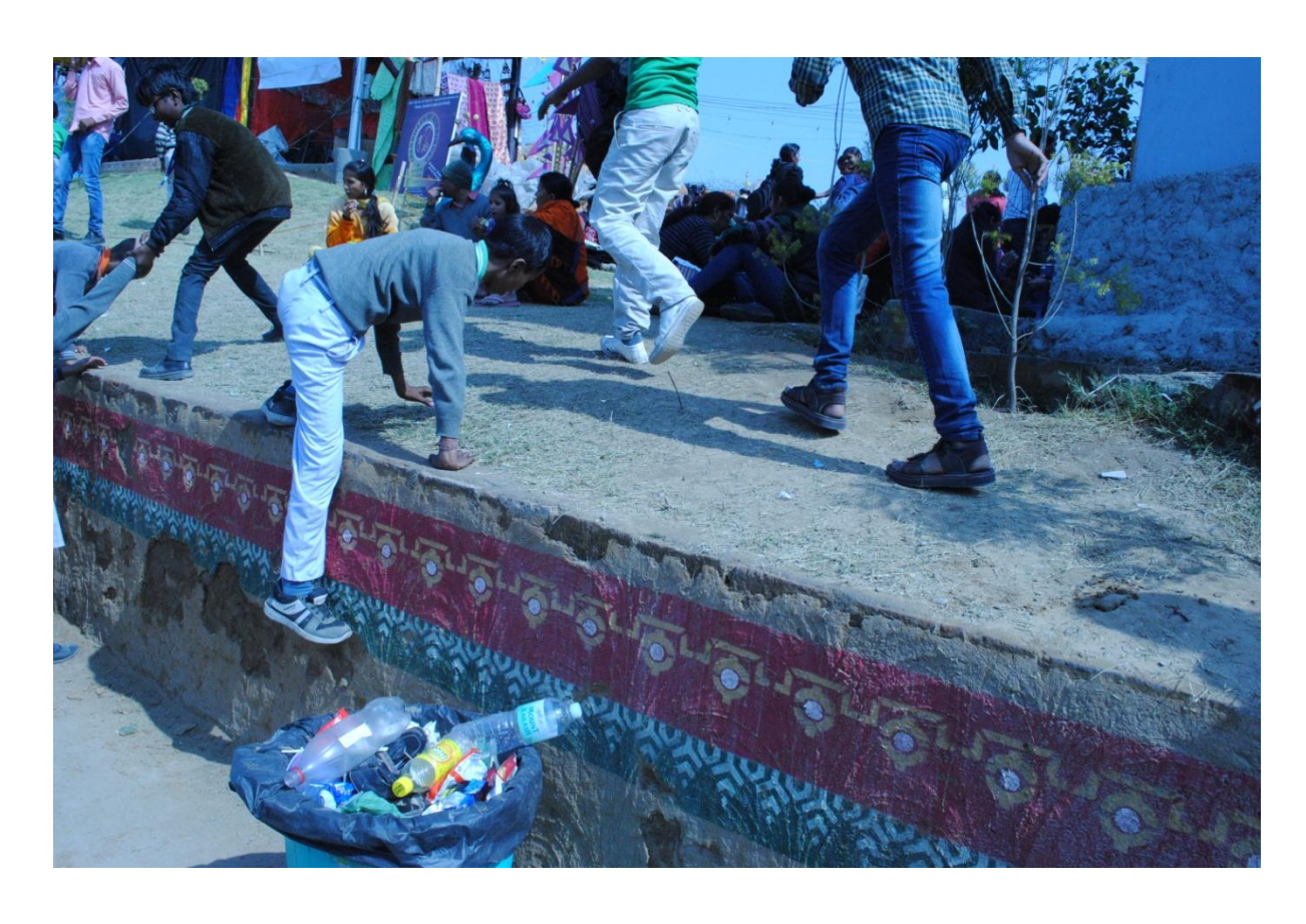
Waste and the Hurry.