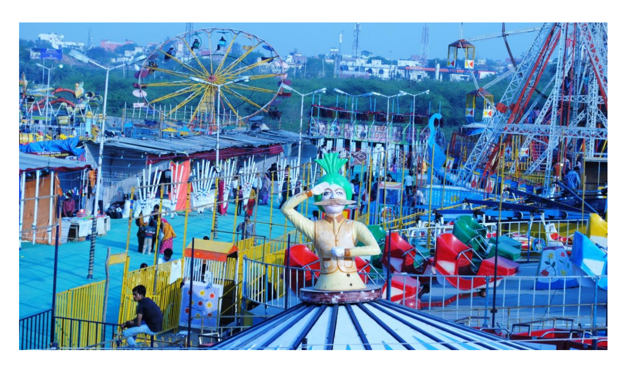
Salute to the S&M team.