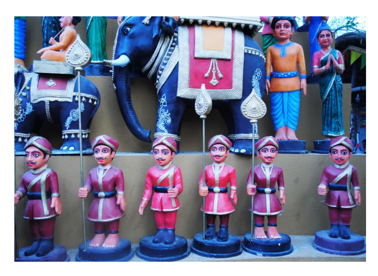
Watan ke Rakhwale