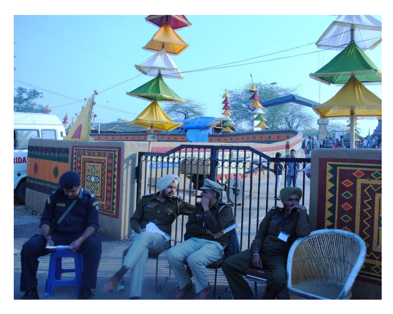
The Camaraderie and the Coterie