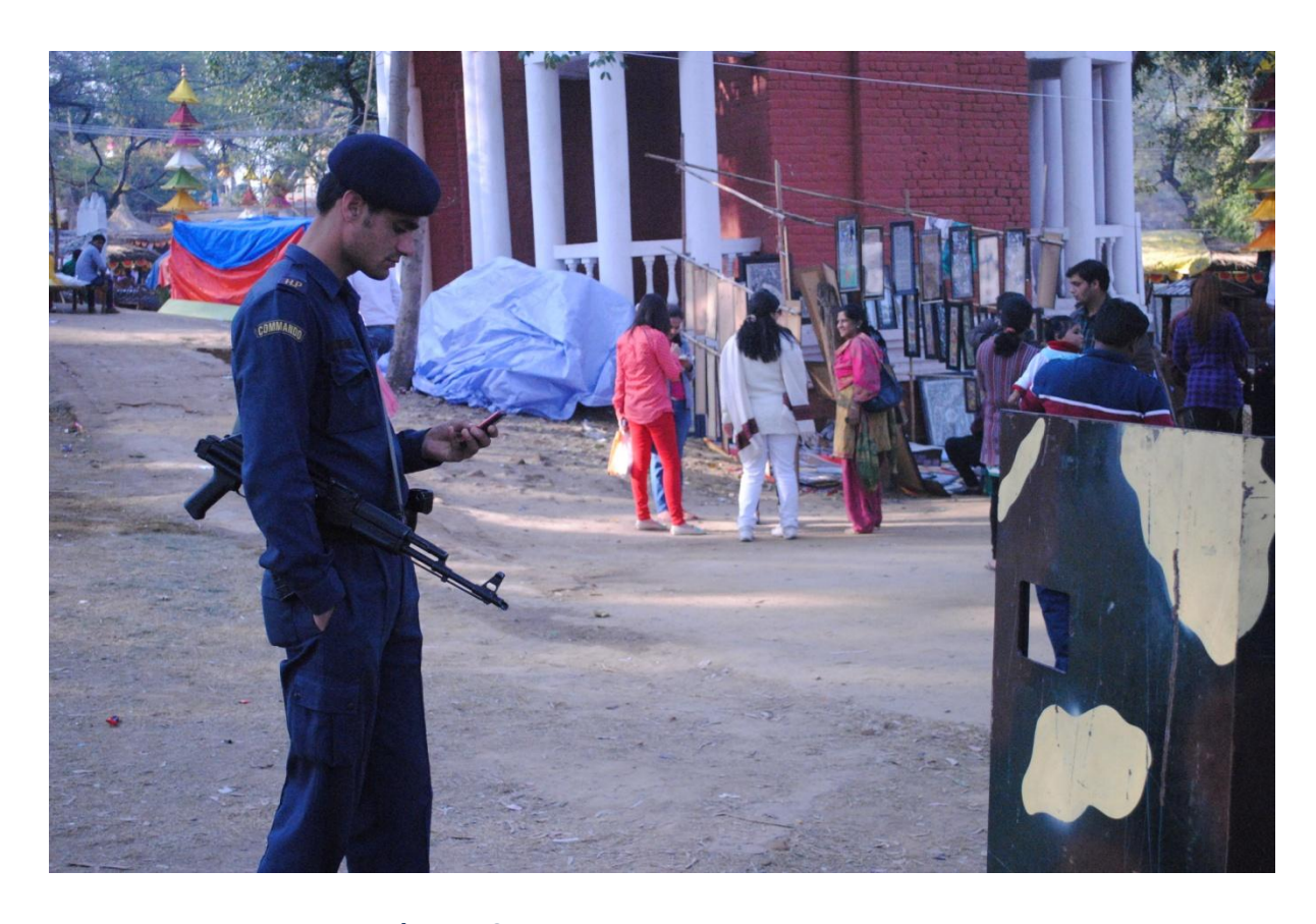
Time over or Time's up?