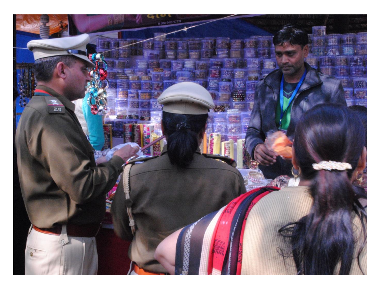
Duty in Shop or Shopping on Duty?