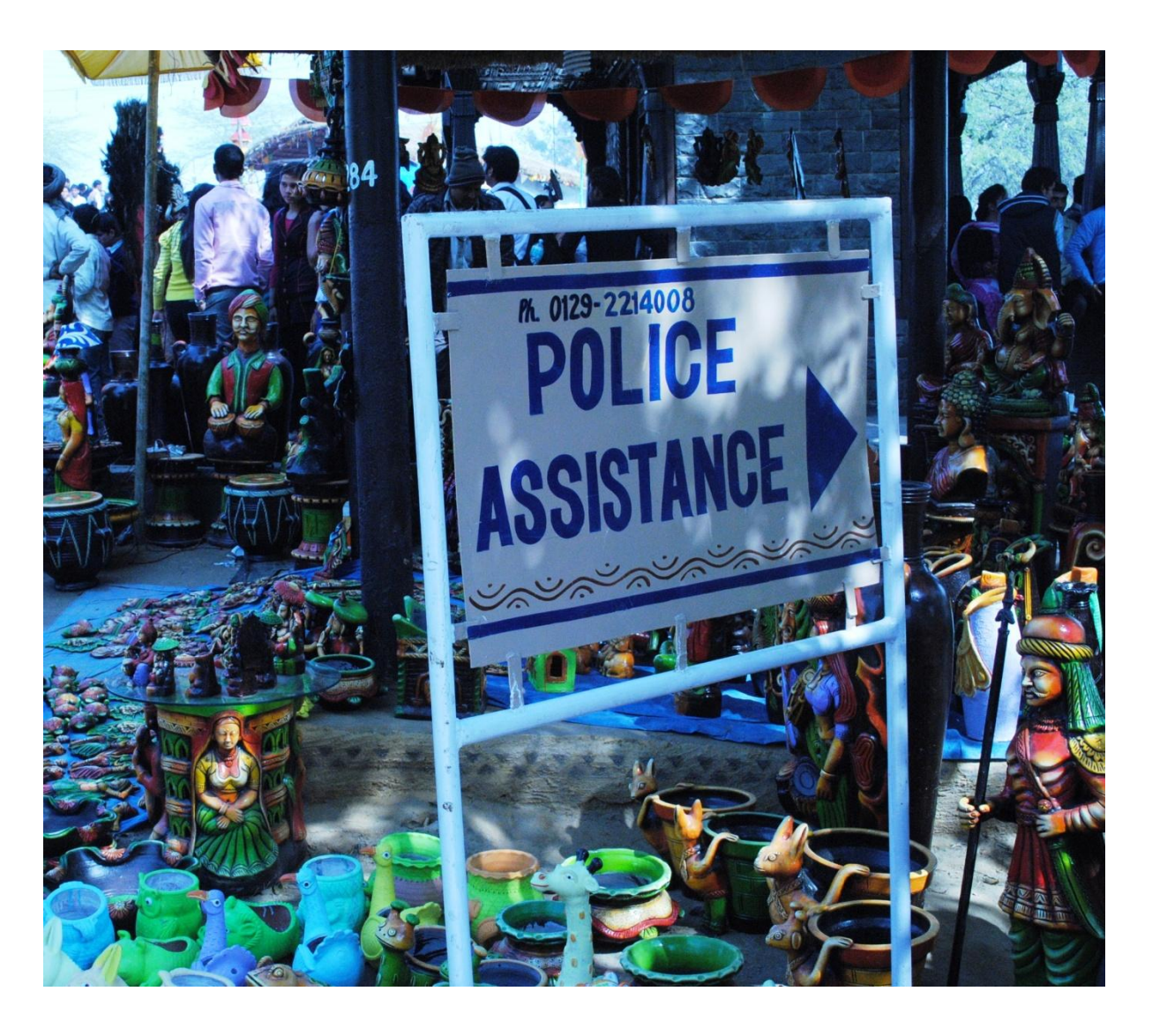
Happy To Help