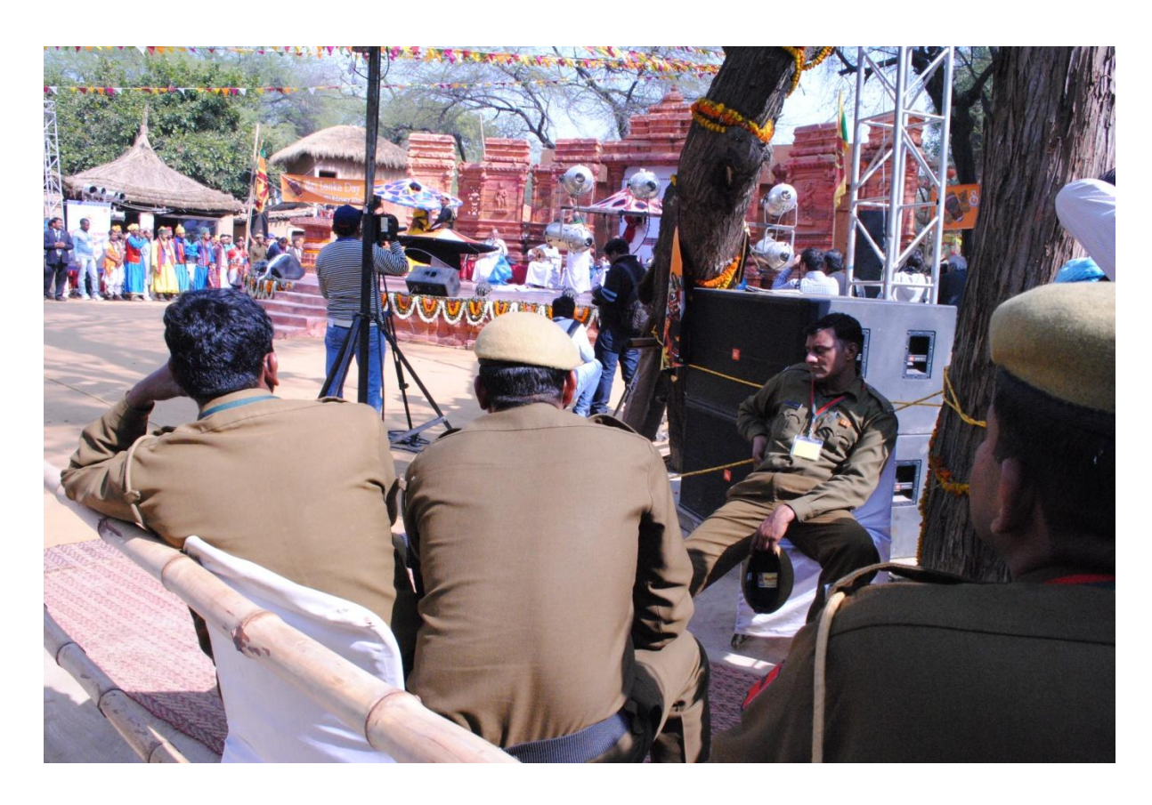
Hard worked or Hardly Worked