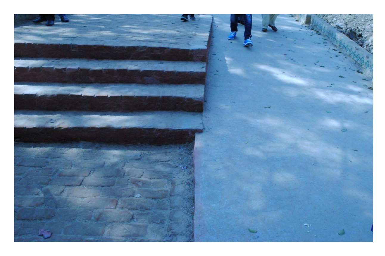
Steep slope Ramps