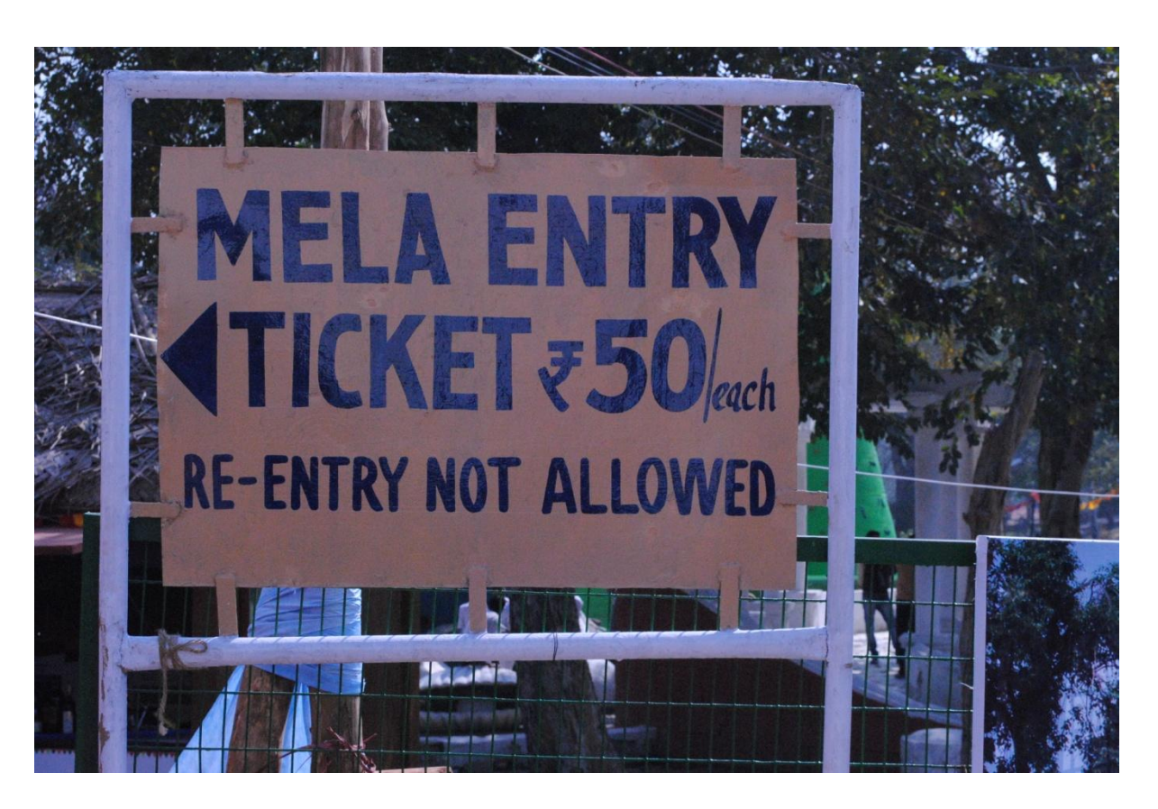
....but Exit is allowed