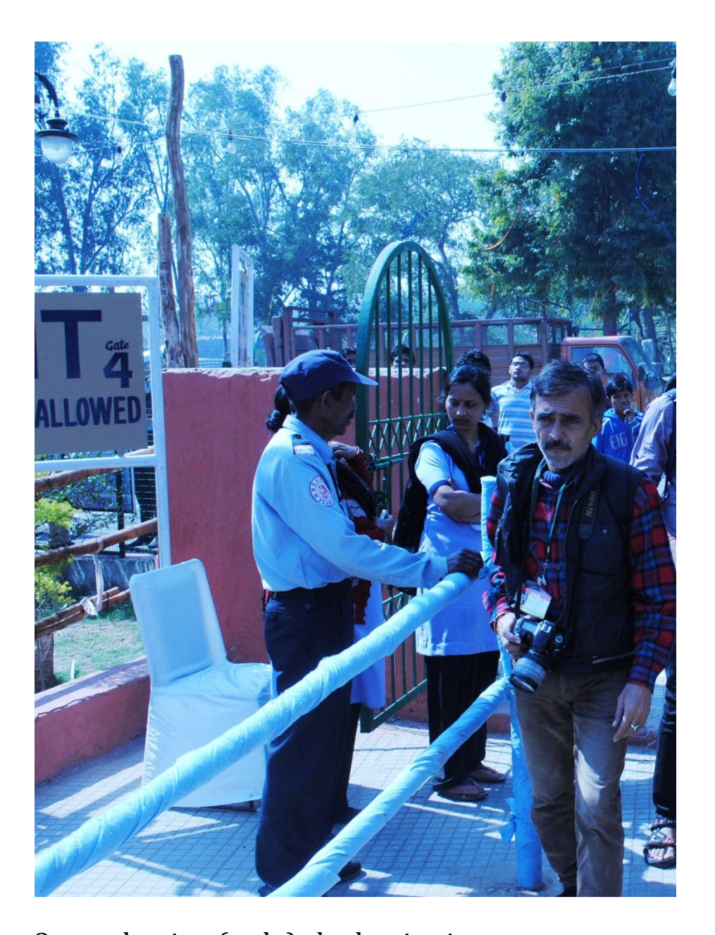
Queue begins (only) the beginning