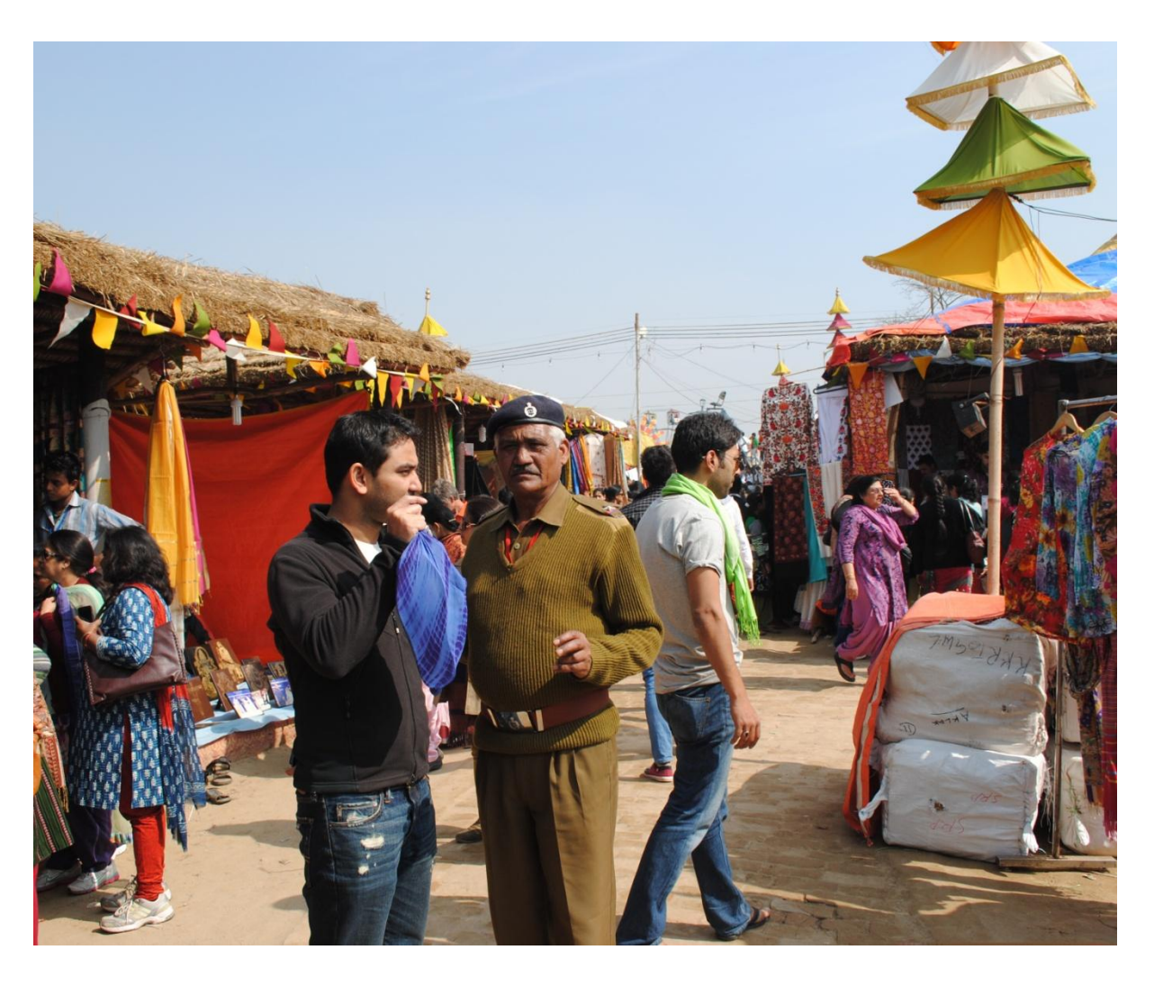
Khaki is the most reliable source of Information