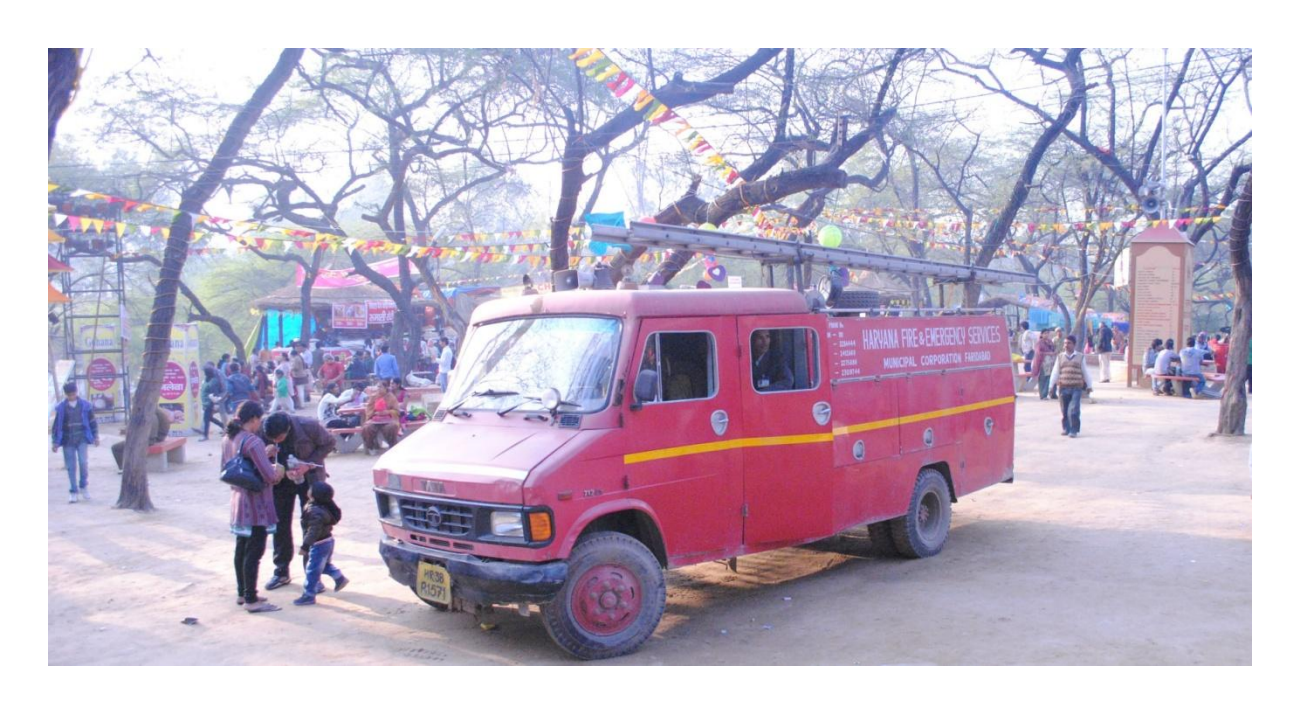
Cool water near the Cooling (Fire emergency) Vehicle.