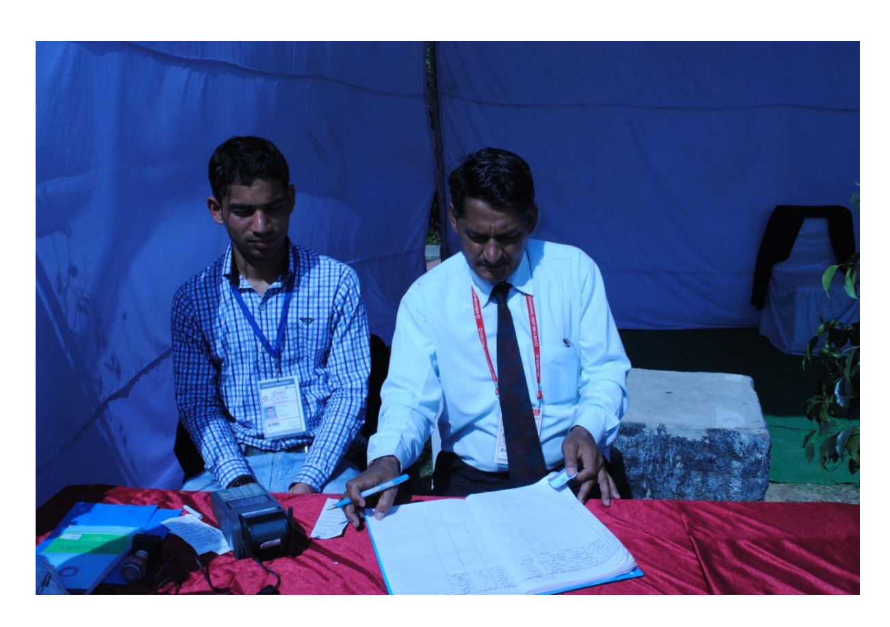
The Security Entrants.