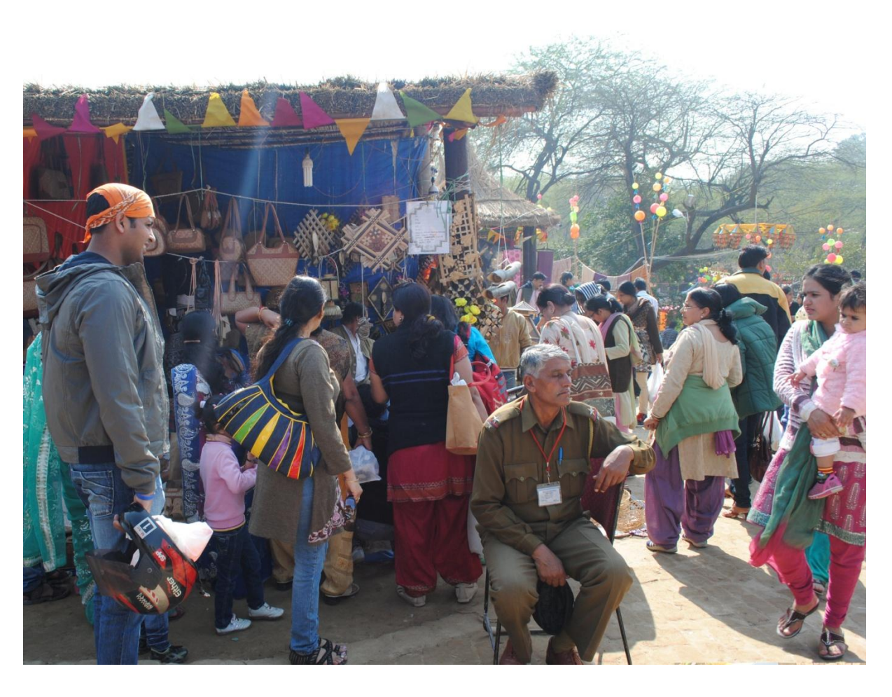
Tired on Duty or Trying to be on duty