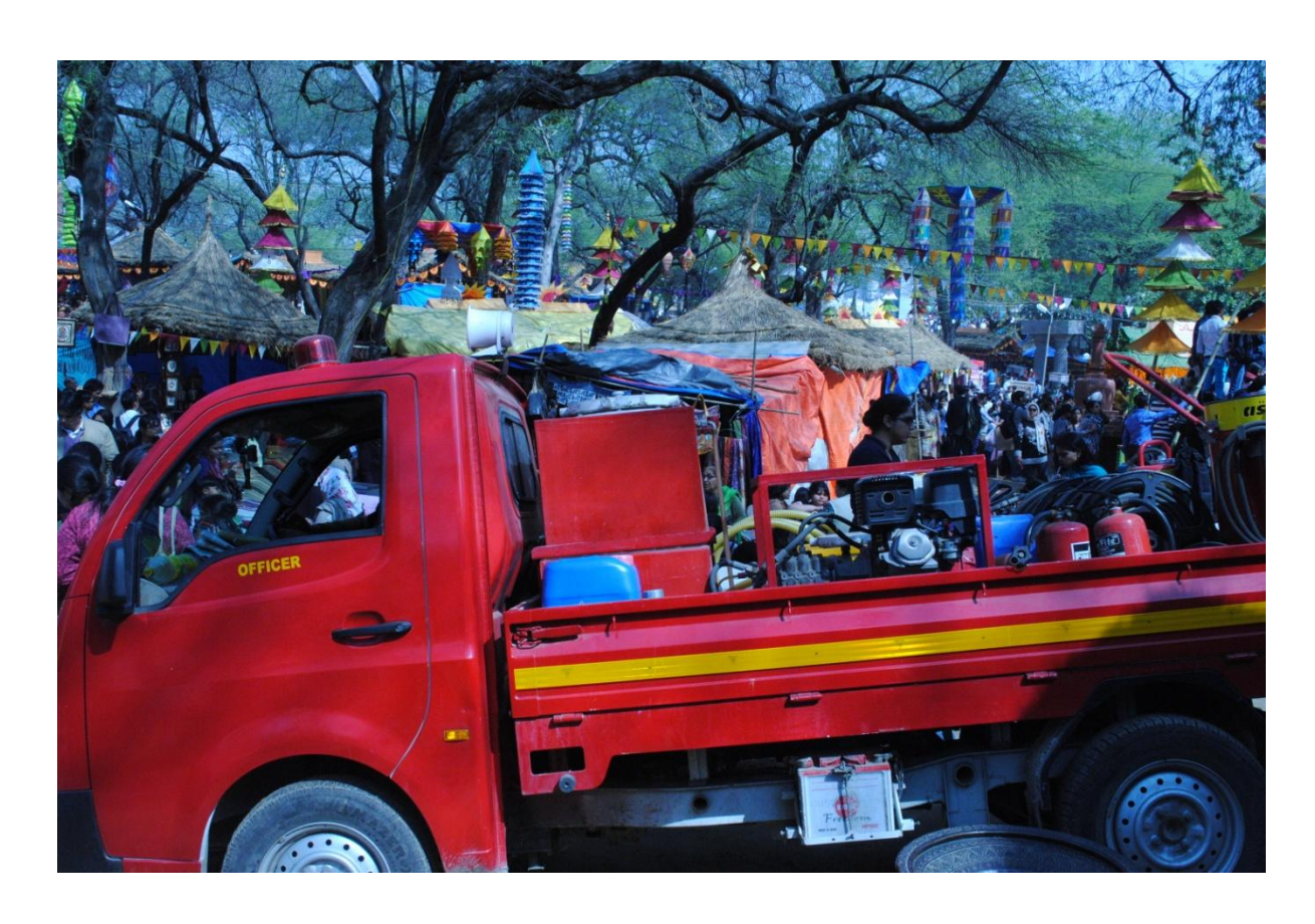
Battery for the Betterment