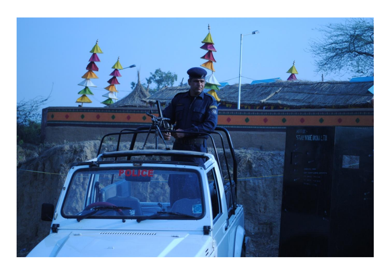
Vehicle rests, I don't.